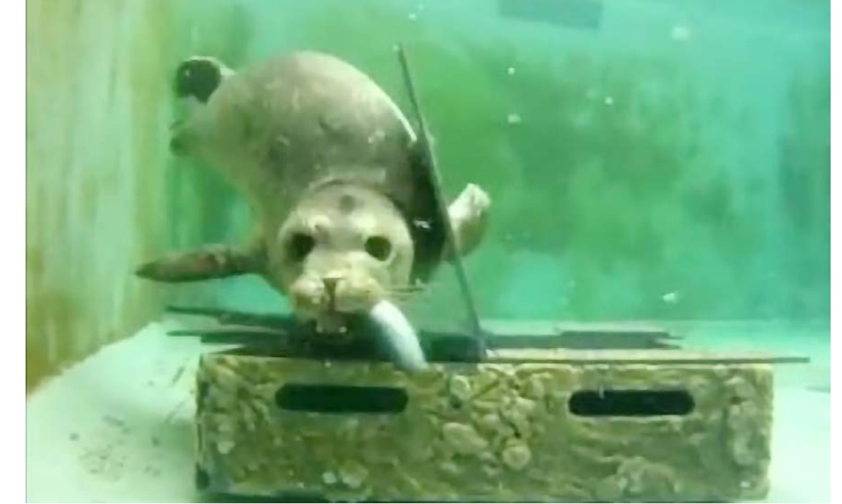
Harbor seal pups like Agaptimoss test their natural instincts with toys like this box full of fish.