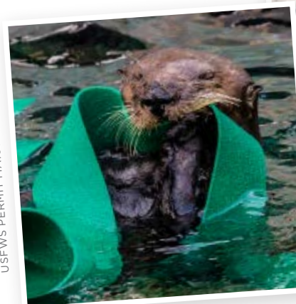
USFWS PERMIT MA101713-1