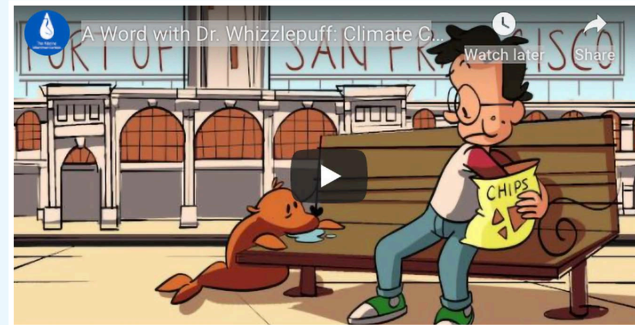
"A Word With Dr. Whizzlepuff" is available on our website along with games and activities for kids.

Fill your family's extra hours with fascinating facts, marine mammal games and a fun video by a Pixar animator.