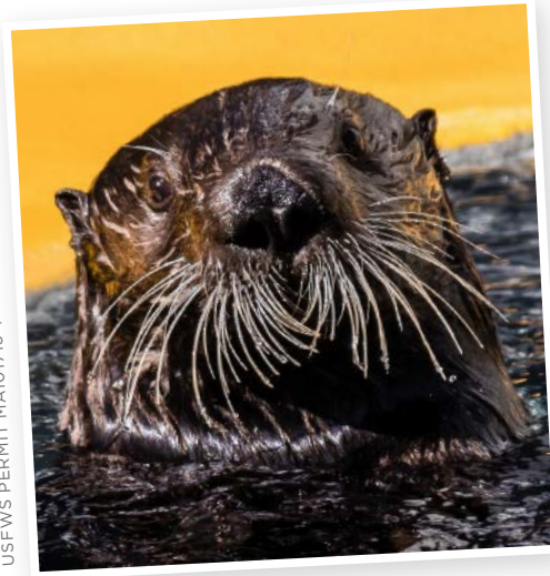
USFWS PERMIT MA101713-1

Just a few of the otter patients who would not have had a fighting chance if it weren't for you. Thank you.